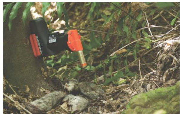
Goodnature A24 rat & stoat trap